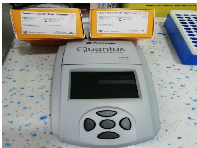
Figure (2) Quantus device with conversion kit